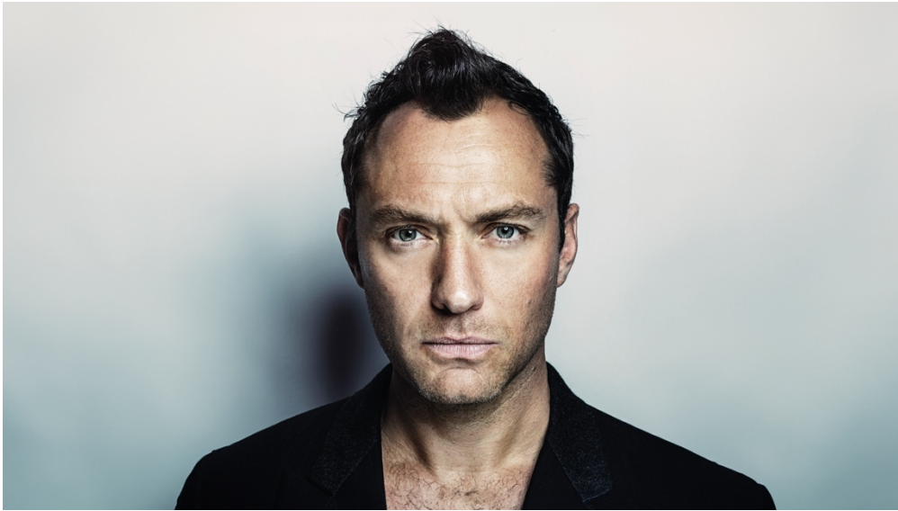
Jude Law