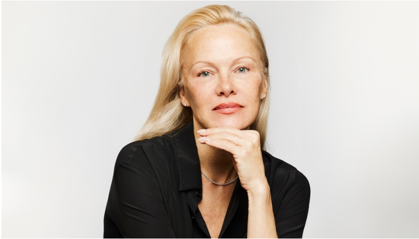
Pamela Anderson