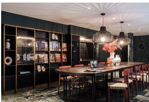
The co-working space at the AMERON hotel for accredited journalists during the ZFF.