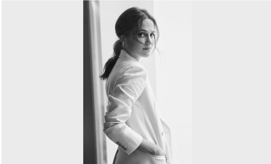
Alicia Vikander