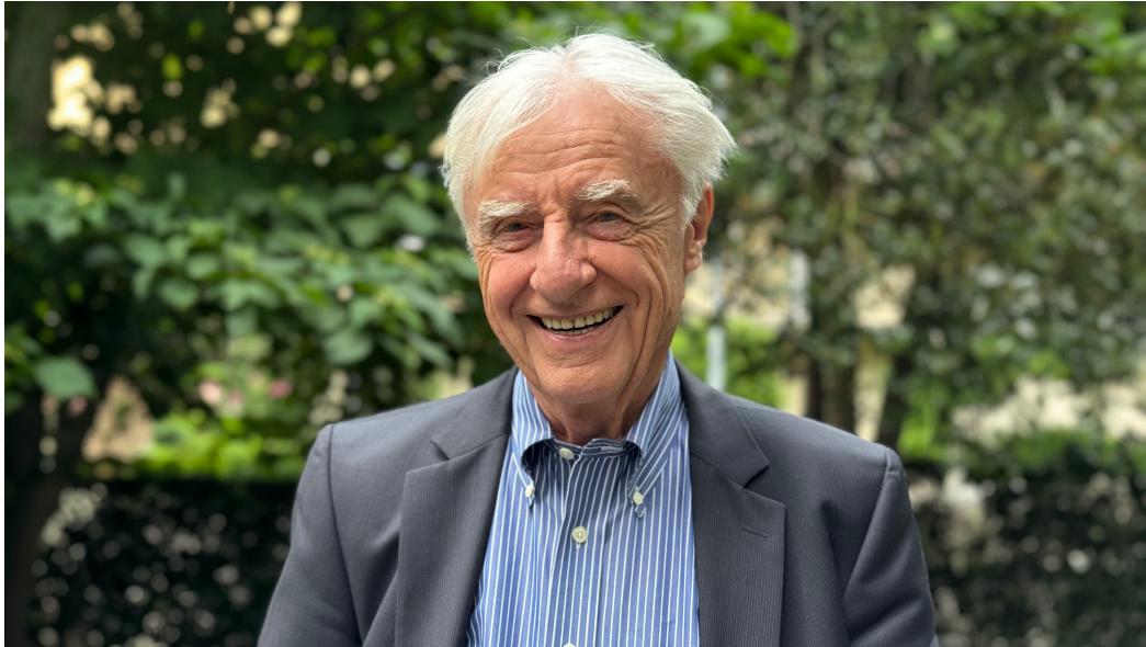
Emil Steinberger