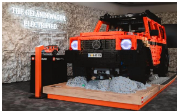
Stars at the ZFF: Mads Mikkelsen (2023) and the G-Class made of around 450,000 LEGO pieces (2024).